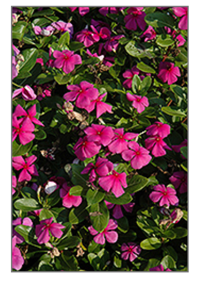
Titan Lilac Vinca flowers