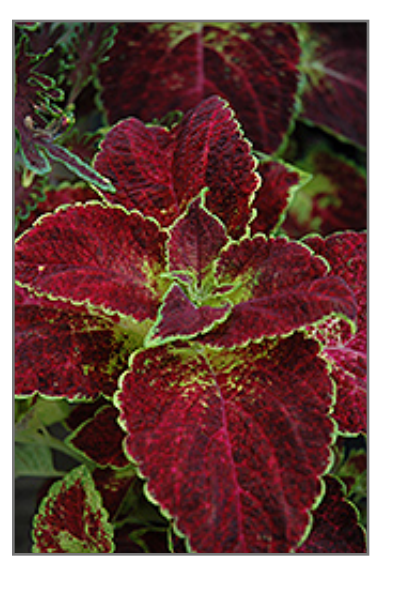
ColorBlaze Dipt in Wine Coleus foliage