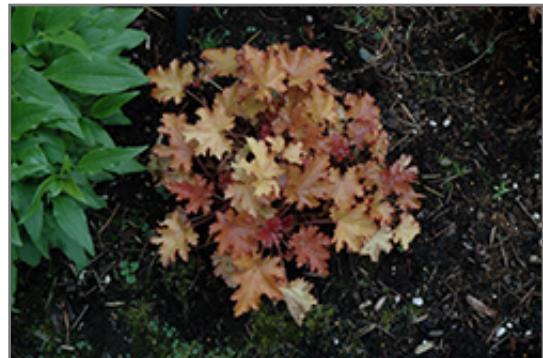
Zipper Coral Bells