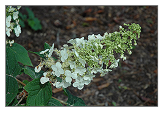
Ellen Huff Hydrangea flowers

11035 York Road Cockeysville, MD 21030 410.527.0700 www.valleyviewfarms.com www.facebook.com/ValleyViewFarms