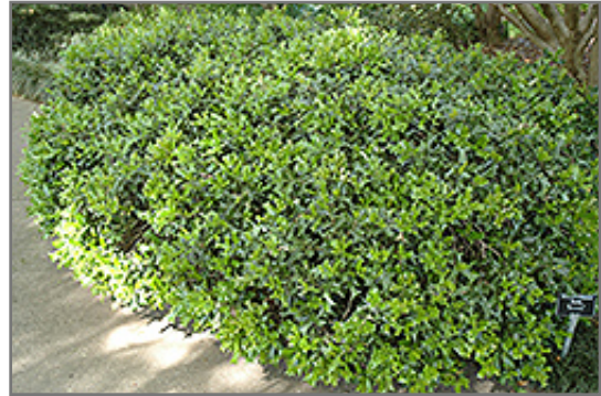
Rotunda Chinese Holly