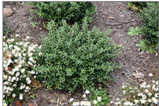
Soft Touch Japanese Holly