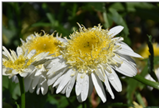
Reaflor Real Glory Shasta Daisy flowers

Reaflor Real Glory Shasta Daisy is recommended for the following landscape applications;