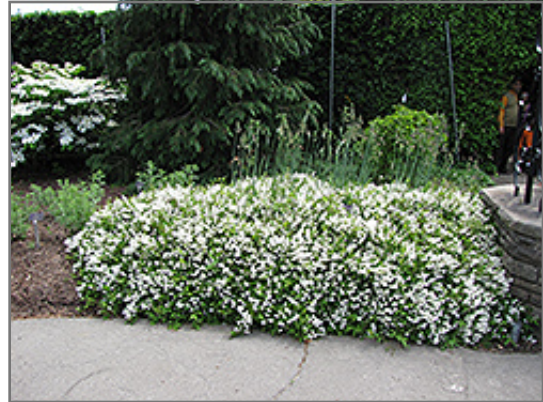
Nikko Deutzia in bloom