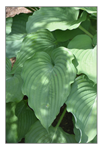
Komodo Dragon Hosta foliage

11035 York Road Cockeysville, MD 21030 410.527.0700 www.valleyviewfarms.com www.facebook.com/ValleyViewFarms