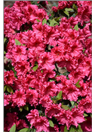
Red Ruffles Azalea flowers