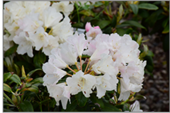
Yaku Princess Rhododendron flowers

Yaku Princess Rhododendron will grow to be about 3 feet tall at maturity, with a spread of 4 feet. It has a low canopy. It grows at a slow rate, and under ideal conditions can be expected to live for 50 years or more.