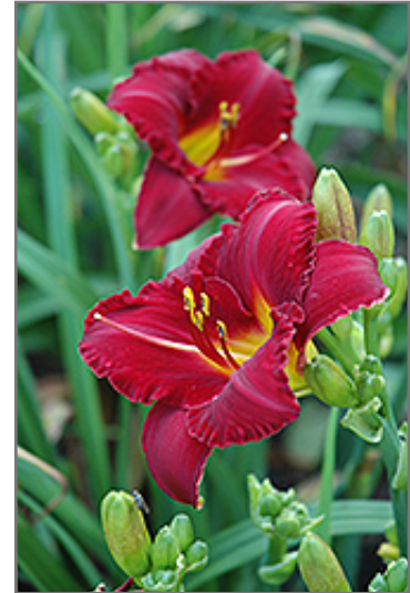
Pygmy Prince Daylily flowers