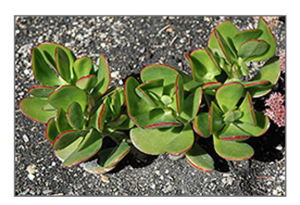
Flapjacks Kalanchoe foliage

Flapjacks Kalanchoe features bold spikes of yellow bell-shaped flowers rising above the foliage from late winter to early spring. Its attractive succulent round leaves remain green in color with distinctive dark red edges throughout the year.