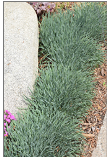
Blue Eddy Ornamental Onion