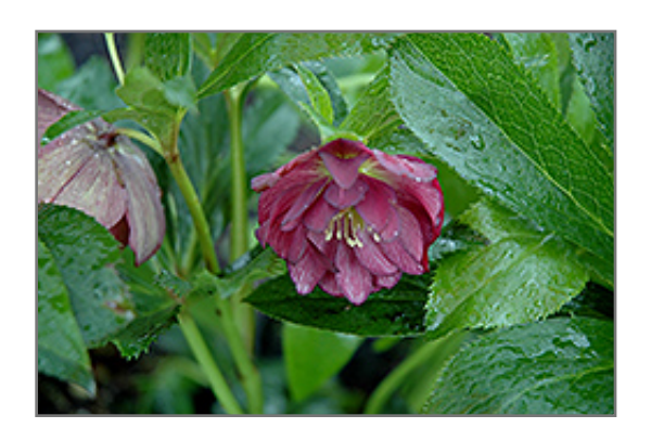
Midnight Ruffles Hellebore flowers