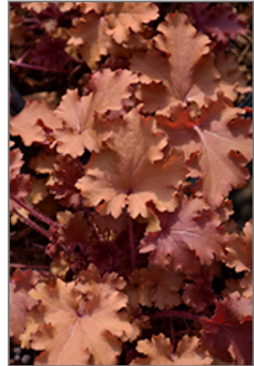
Peach Crisp Coral Bells foliage

Peach Crisp Coral Bells will grow to be about 14 inches tall at maturity extending to 20 inches tall with the flowers, with a spread of 18 inches. When grown in masses or used as a bedding plant, individual plants should be spaced approximately 15 inches apart. Its foliage tends to remain dense right to the ground, not requiring facer plants in front. It grows at a medium rate, and under ideal conditions can be expected to live for approximately 10 years. As an evergreen perennial, this plant will typically keep its form and foliage year-round.