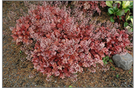
Peach Crisp Coral Bells in bloom

Peach Crisp Coral Bells is recommended for the following landscape applications;