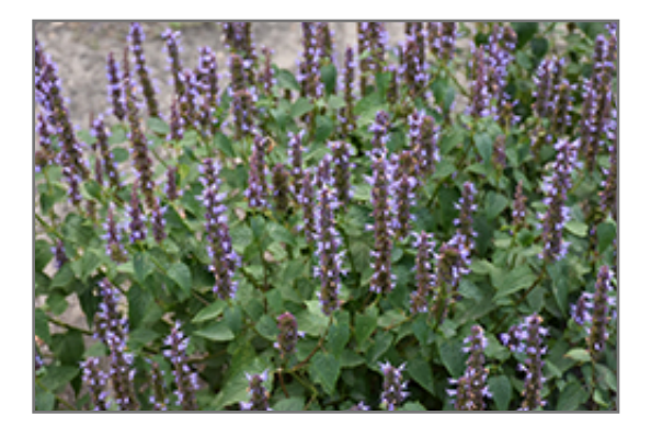
Little Adder Hyssop flowers