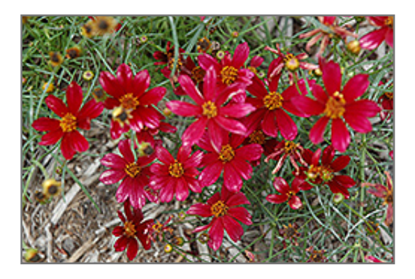
Main Street Tickseed flowers