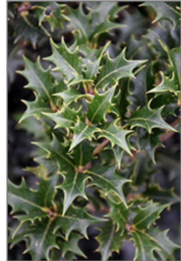
Gulftide False Holly foliage

Gulftide False Holly is recommended for the following landscape applications;