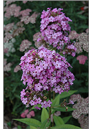
Jeana Garden Phlox flowers

Jeana Garden Phlox is recommended for the following landscape applications;