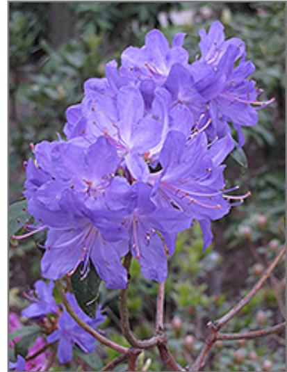
Blue Baron Rhododendron flowers