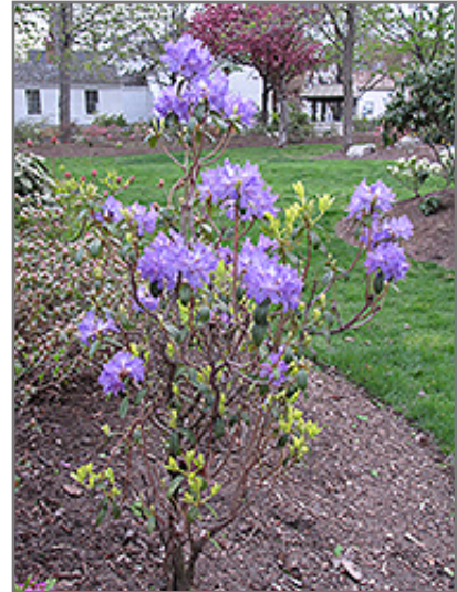
Blue Baron Rhododendron in bloom

This shrub does best in full sun to partial shade. You may want to keep it away from hot, dry locations that receive direct afternoon sun or which get reflected sunlight, such as against the south side of a white wall. It requires an evenly moist well-drained soil for optimal growth, but will die in standing water. It is very fussy about its soil conditions and must have rich, acidic soils to ensure success, and is subject to chlorosis (yellowing) of the foliage in alkaline soils. It is somewhat tolerant of urban pollution, and will benefit from being planted in a relatively sheltered location. Consider applying a thick mulch around the root zone in winter to protect it in exposed locations or colder microclimates. This particular variety is an interspecific hybrid.