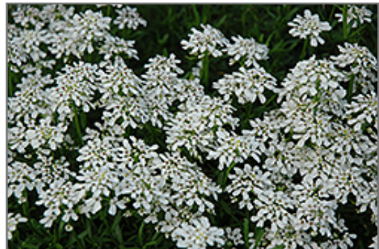
Little Gem Candytuft flowers