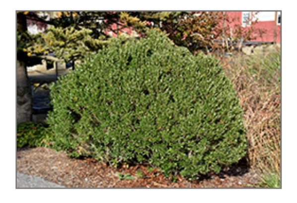
Shamrock Inkberry Holly