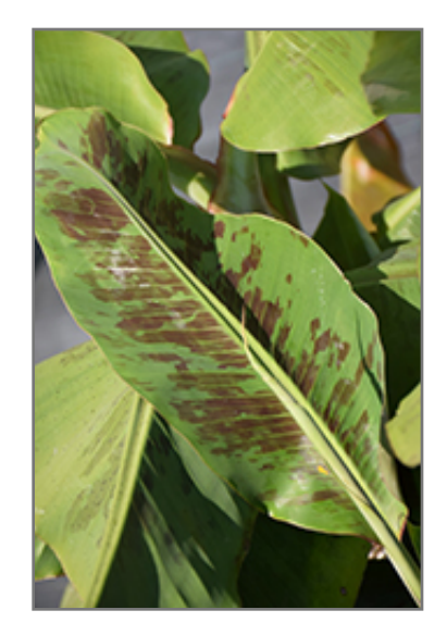
Japanese Banana foliage