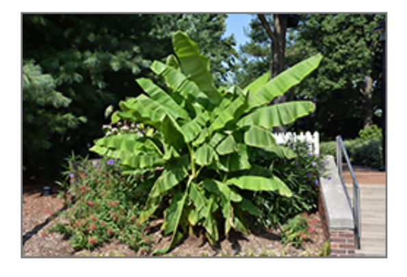
Japanese Banana