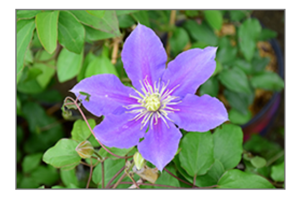
Chevalier Clematis flowers