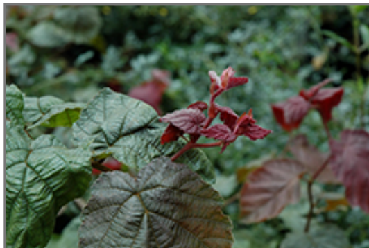
Red Dragon Corkscrew Hazelnut foliage