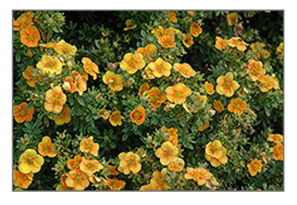
Mango Tango Potentilla flowers