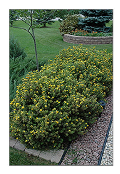
Mango Tango Potentilla in bloom