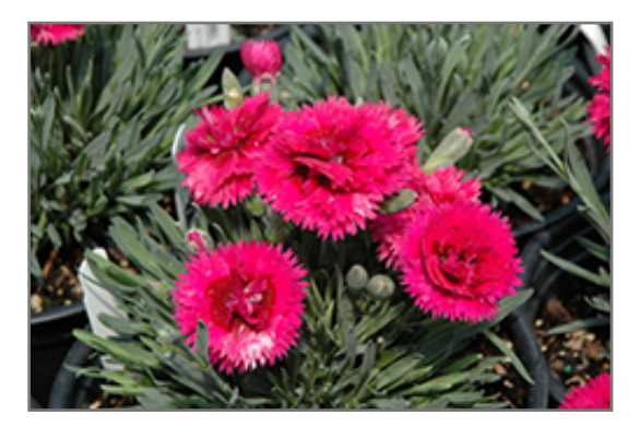
Starlette Pinks flowers