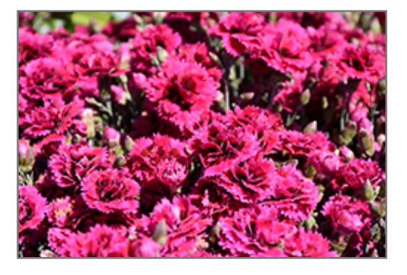
Starlette Pinks flowers