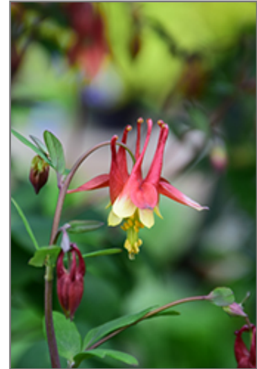
Wild Red Columbine flowers

Wild Red Columbine is recommended for the following landscape applications;