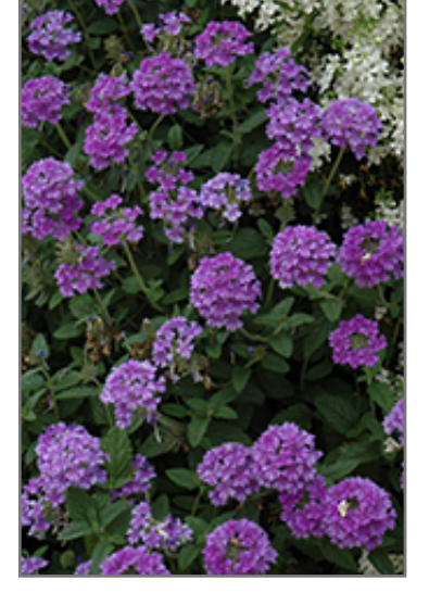
EnduraScape Blue Verbena flowers