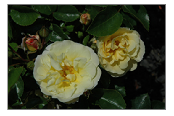
Popcorn Drift Rose flowers

11035 York Road Cockeysville, MD 21030 410.527.0700 www.valleyviewfarms.com www.facebook.com/ValleyViewFarms