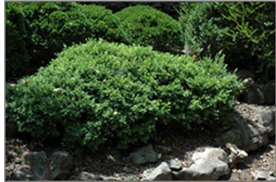
Grace Hendrick Phillips Boxwood

Grace Hendrick Phillips Boxwood is recommended for the following landscape applications;