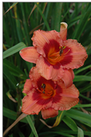
Holiday Song Daylily flowers