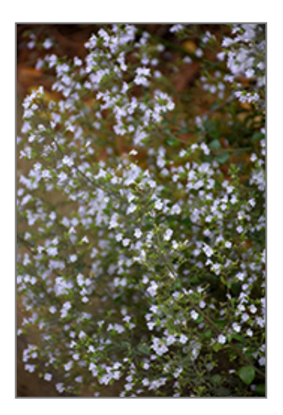
Dwarf Calamint flowers

11035 York Road Cockeysville, MD 21030 410.527.0700 www.valleyviewfarms.com www.facebook.com/ValleyViewFarms