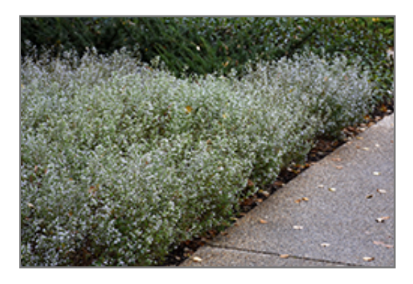
Dwarf Calamint in bloom

Dwarf Calamint is recommended for the following landscape applications;