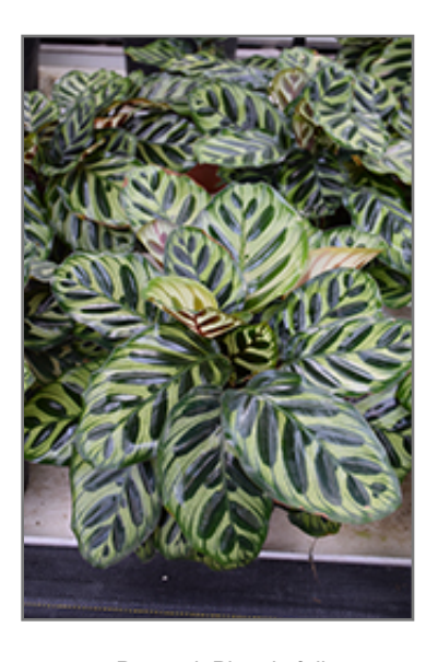
Peacock Plant in full

When grown indoors, Peacock Plant can be expected to grow to be about 24 inches tall at maturity, with a spread of 18 inches. It grows at a slow rate, and under ideal conditions can be expected to live for approximately 5 years. This houseplant should only be grown away from direct sunlight or in a room with strong artificial light. It does best in average to evenly moist soil, but will not tolerate standing water. The surface of the soil shouldn't be allowed to dry out completely, and so you should expect to water this plant once and possibly even twice each week. Be aware that your particular watering schedule may vary depending on its location in the room, the pot size, plant size and other conditions; if in doubt, ask one of our experts in the store for advice. It is not particular as to soil pH, but grows best in rich soil. Contact the store for specific recommendations on pre-mixed potting soil for this plant.