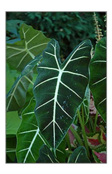
Frydek Elephant's Ear foliage

When grown indoors, Frydek Elephant's Ear can be expected to grow to be about 3 feet tall at maturity, with a spread of 3 feet. It grows at a medium rate, and under ideal conditions can be expected to live for approximately 5 years. This houseplant will do well in a location that gets either direct or indirect sunlight, although it will usually require a more brightly-lit environment than what artificial indoor lighting alone can provide. It is quite adaptable, prefering to grow in average to wet conditions, and will even tolerate some standing water. The surface of the soil should be kept consistently moist all of the time, and you should expect to water this plant two or more times each week, especially if it's growing in a low-humidity environment. Be aware that your particular watering schedule may vary depending on its location in the room, the pot size, plant size and other conditions; if in doubt, ask one of our experts in the store for advice. It is not particular as to soil type or pH; an average potting soil should work just fine. Be warned that parts of this plant are known to be toxic to humans and animals, so special care should be exercised if growing it around children and pets.