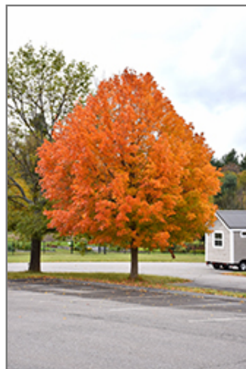
Sugar Maple in fall