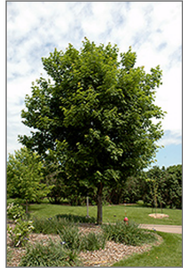
Sugar Maple

This tree should only be grown in full sunlight. It prefers to grow in average to moist conditions, and shouldn't be allowed to dry out. It is not particular as to soil pH, but grows best in rich soils. It is somewhat tolerant of urban pollution. This species is native to parts of North America.