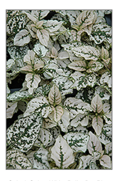
Splash Select White Polka Dot Plant foliage

When grown indoors, Splash Select White Polka Dot Plant can be expected to grow to be about 12 inches tall at maturity, with a spread of 12 inches. It grows at a fast rate, and under ideal conditions can be expected to live for approximately 5 years. This houseplant will do well in a location that gets either direct or indirect sunlight, although it will usually require a more brightly-lit environment than what artificial indoor lighting alone can provide. It does best in average to evenly moist soil, but will not tolerate standing water. The surface of the soil shouldn't be allowed to dry out completely, and so you should expect to water this plant once and possibly even twice each week. Be aware that your particular watering schedule may vary depending on its location in the room, the pot size, plant size and other conditions; if in doubt, ask one of our experts in the store for advice. It is not particular as to soil type or pH; an average potting soil should work just fine.