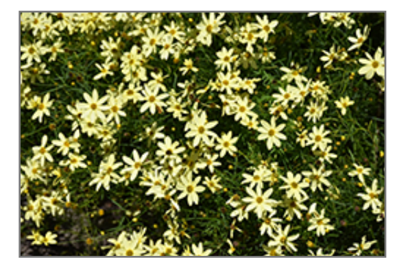
Moonbeam Tickseed flowers