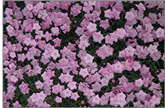
Bath's Pink Pinks in bloom

Bath's Pink Pinks is recommended for the following landscape applications;