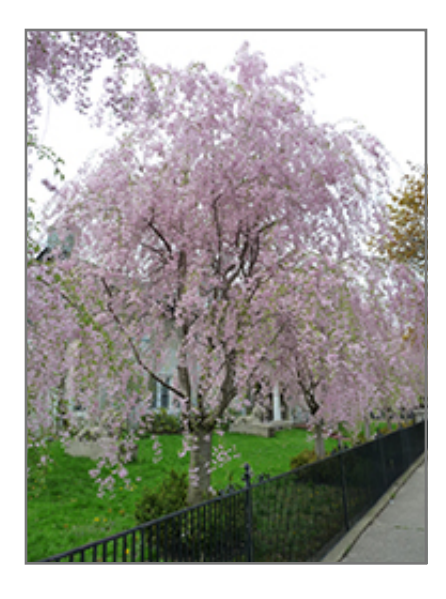
Weeping Higan Cherry in bloom