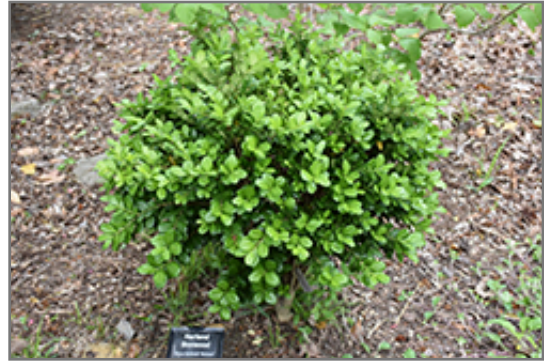
Richard Harland Boxwood