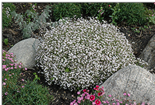
Creeping Baby's Breath in bloom