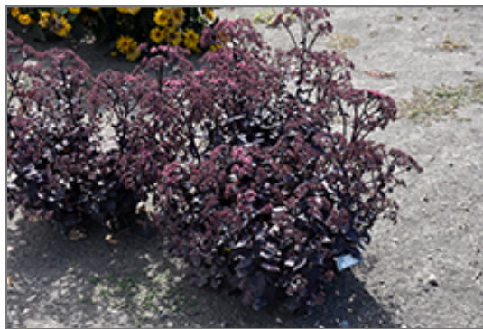
Cherry Truffle Stonecrop in bloom