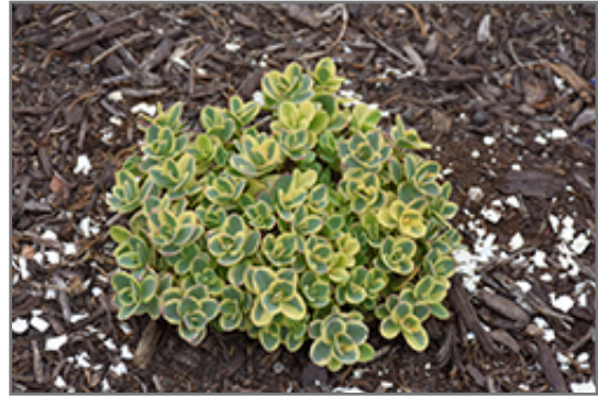
Lime Twister Stonecrop