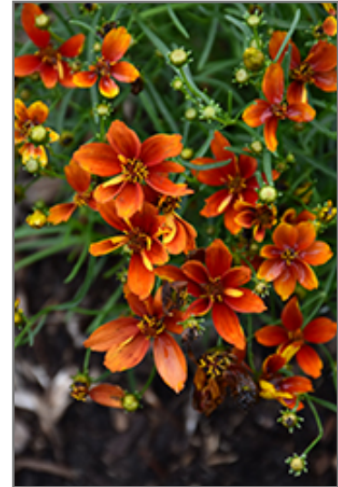
Sizzle And Spice Crazy Cayenne Tickseed flowers

Sizzle And Spice Crazy Cayenne Tickseed is recommended for the following landscape applications;