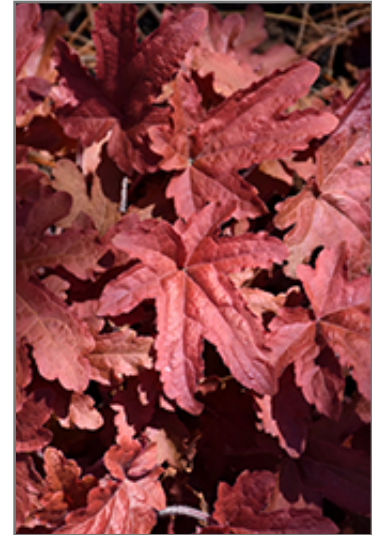
Fun and Games Red Rover Foamy Bells foliage

This is a relatively low maintenance plant, and should be cut back in late fall in preparation for winter. It is a good choice for attracting hummingbirds to your yard. It has no significant negative characteristics.