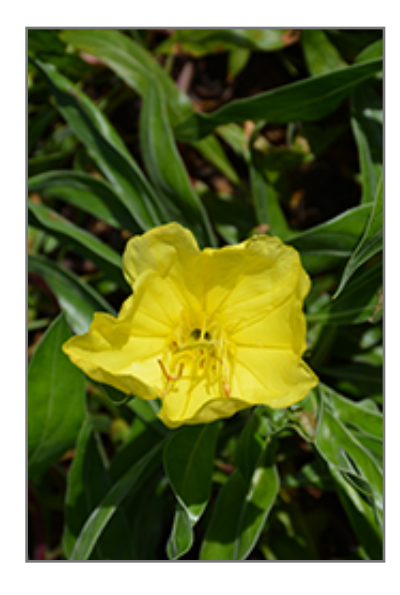
Ozark Sundrops flowers

A vigorous trailing plant with lance shaped green foliage with white midribs; sunny yellow, cup shaped flowers bloom over a long season; seed pods can be dried for floral arrangements; perfect for rock gardens or border fronts