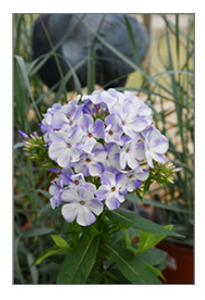
Flame Blue Garden Phlox flowers