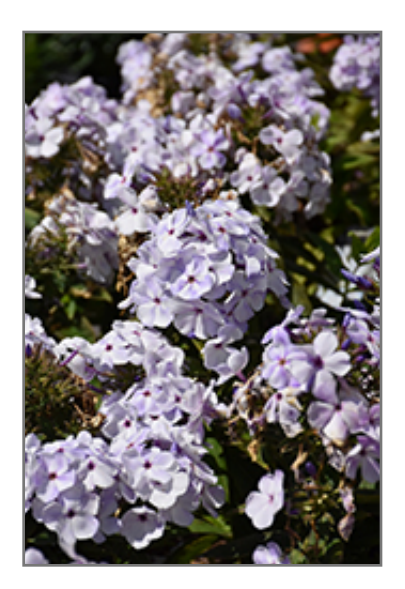
Flame Blue Garden Phlox flowers

11035 York Road Cockeysville, MD 21030 410.527.0700 www.valleyviewfarms.com www.facebook.com/ValleyViewFarms