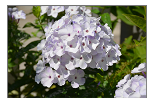
Flame Blue Garden Phlox flowers

Flame Blue Garden Phlox is a dense herbaceous perennial with an upright spreading habit of growth. Its medium texture blends into the garden, but can always be balanced by a couple of finer or coarser plants for an effective composition.