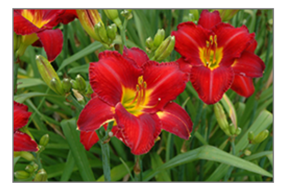
Chicago Apache Daylily flowers